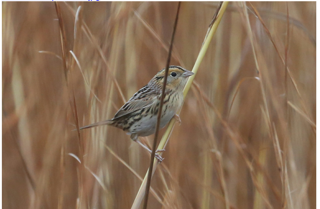
Le Conte's Sparrow 2.jpg