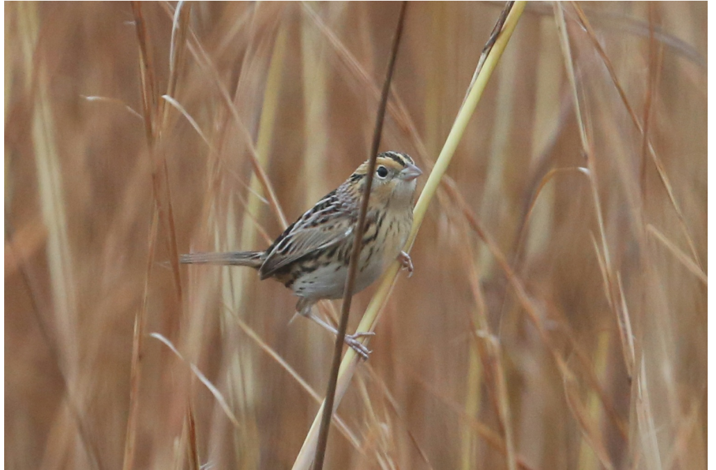
Le Conte's Sparrow 1.jpg