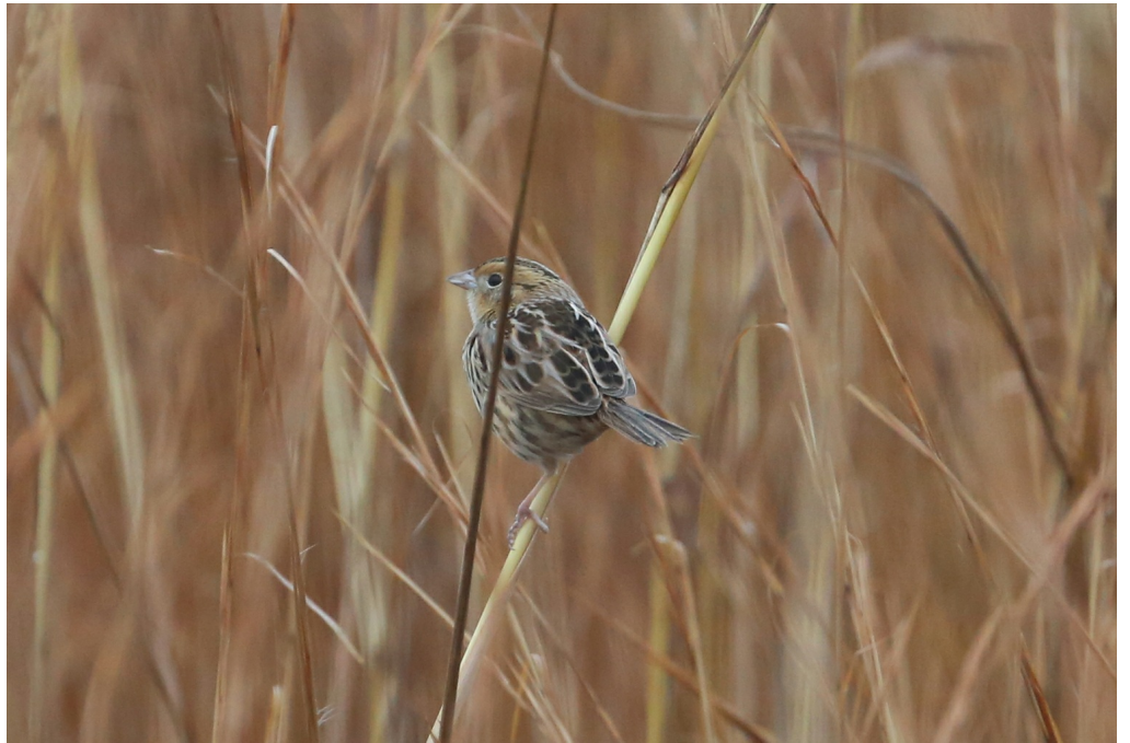
Le Conte's Sparrow 3.jpg